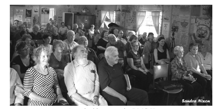
A packed house at the BMC Hut

He will be greatly missed, but not forgotten.