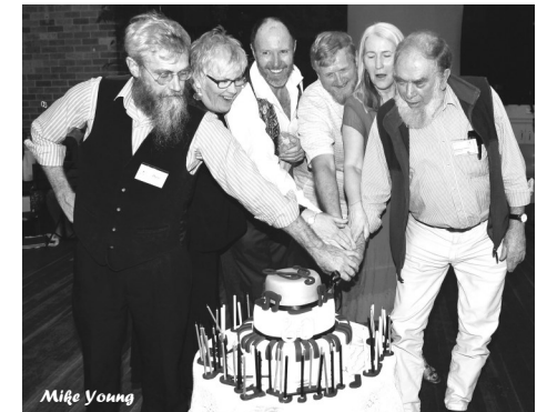
BMC Presidents cutting the cake