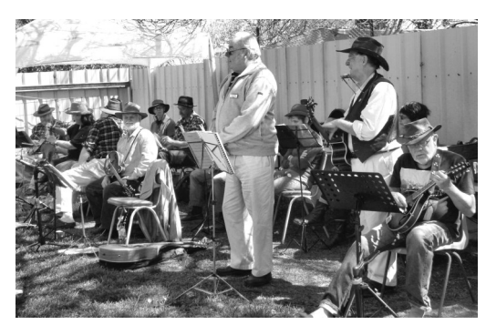
Concert Party at Yeoval