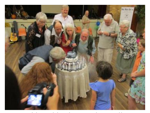
Presidents blowing out the candles.