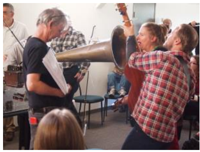
NLA wax cylinder recording at the NFF