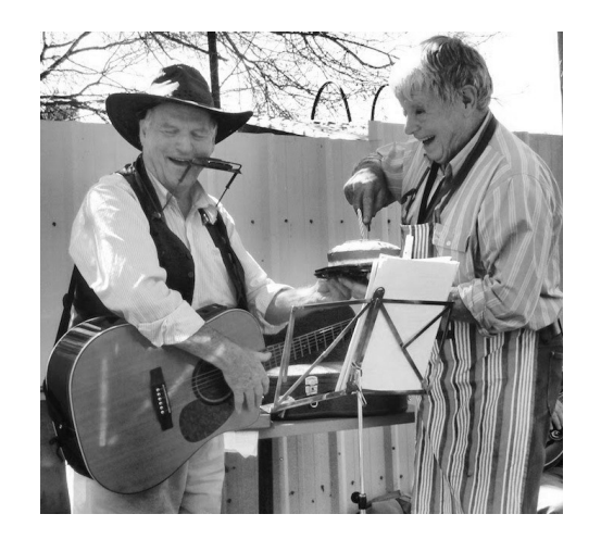
Yeoval Concert Molong Bush Dance