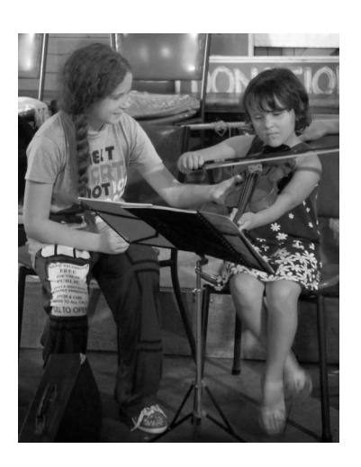
Saplings Afternoon Session