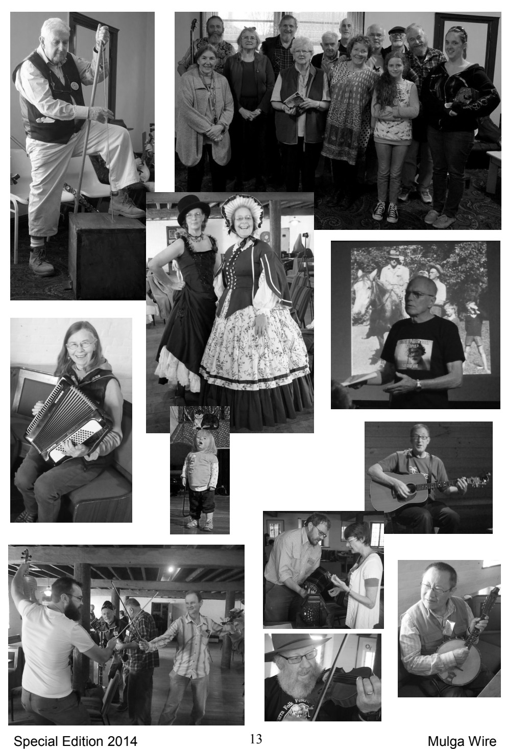
Mulga Wire Special Edition 2014