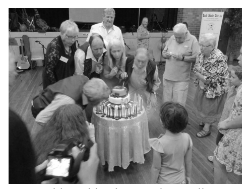
Presidents blowing out the candles.