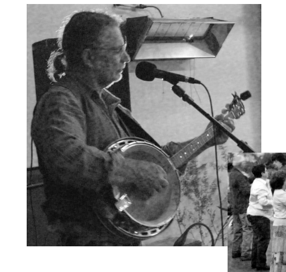
BMC Concert Party gave a concert at the Banjo Paterson Museum at Yeoval, and played for a bush dance at Molong.