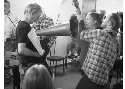
NLA wax cylinder recording at the NFF