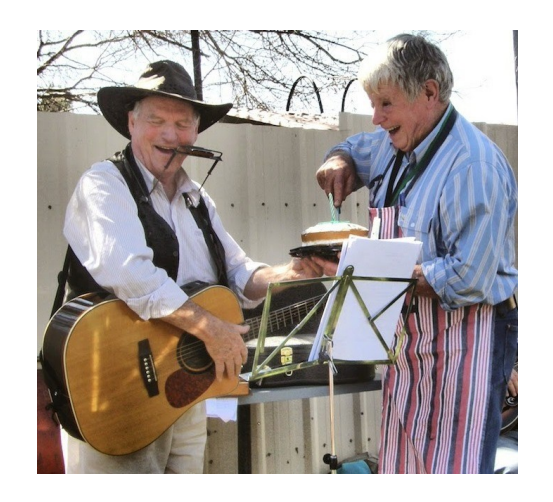
Yeoval Concert Molong Bush Dance