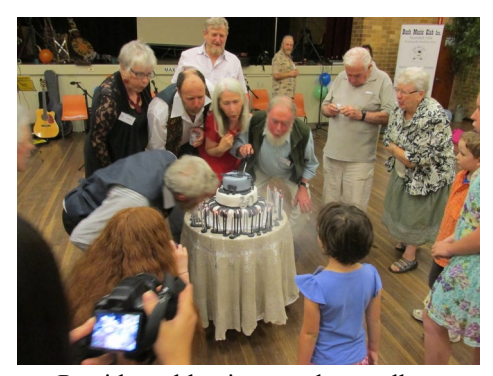
Presidents blowing out the candles.