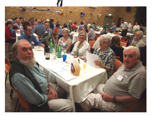
Anniversary Dinner - March