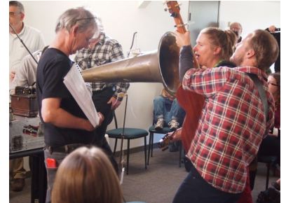
NLA wax cylinder recording at the NFF