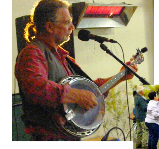
at the Banjo Paterson Museum at Yeoval, and played for a bush dance