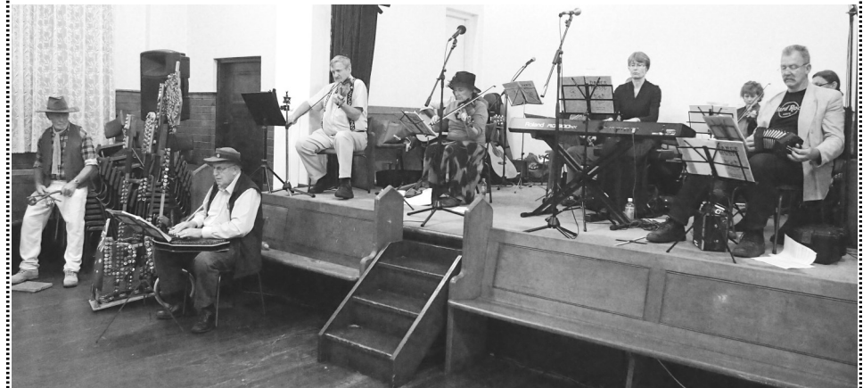
Concert Party playing for the Fundraiser Bushdance at Dulwich Hill.