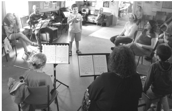
Teaching a shanty