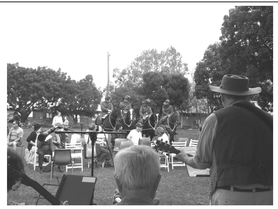
The BMC Concert Party performed to an unusual audience at the Addison Road Community Centre "Tails from the Past" event.