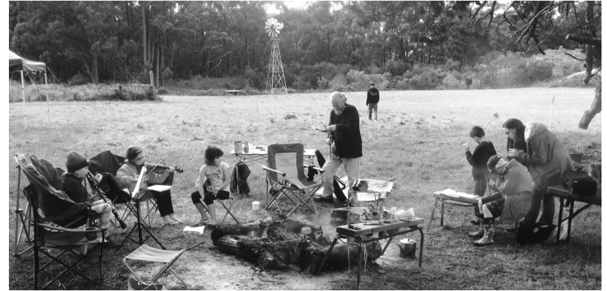
Saplings gathered around the campfire.

The Eureka Rebellion in 1854 was a rebellion of gold miners at Ballarat The Battle of the Eureka Stockade, by which the rebellion is popularly known, was fought between miners and the Colonial forces ('traps') of Australia on 3 De-