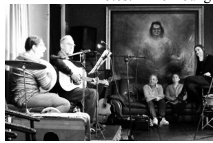
The picture gave a spooky feel