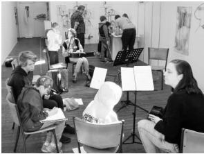
Tune writing

Another masterclass was held in the Addison Rd Centre in August. The event was again well attended and helped to introduce a new generation to Australian folk music.