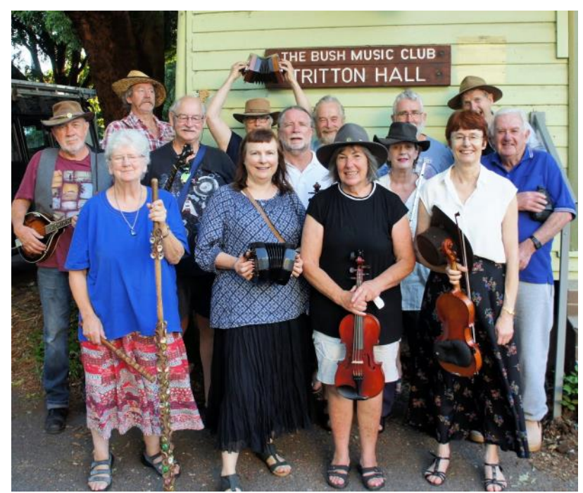
Concert Party group photo in front of the hut. Photo: