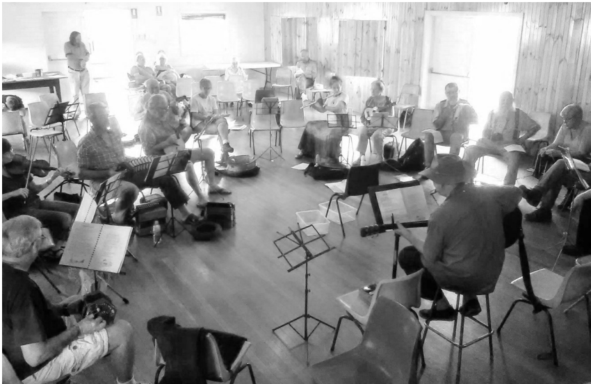
Session at Sofala