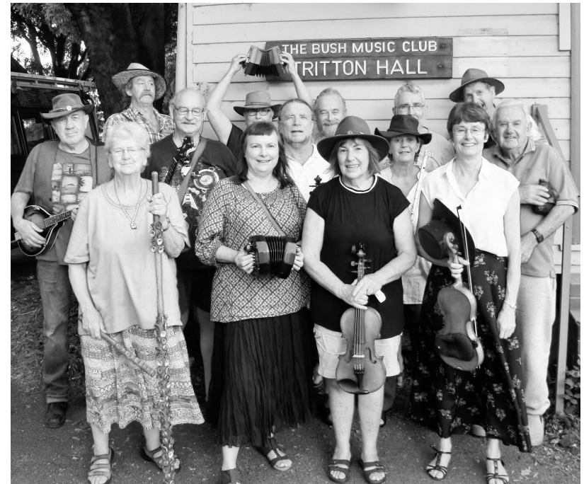
Concert Party group photo in front of the hut.