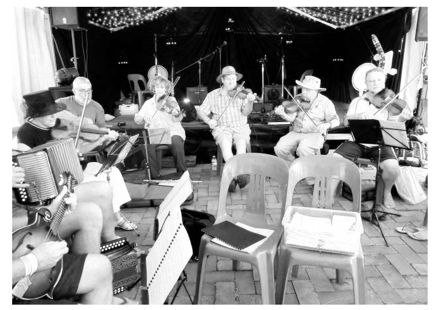
Concert Party at the Illawarra Folk Festival.