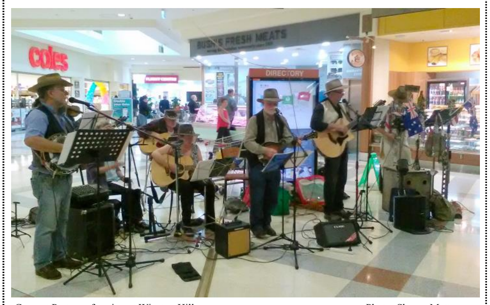
Concert Party performing at Winston Hills