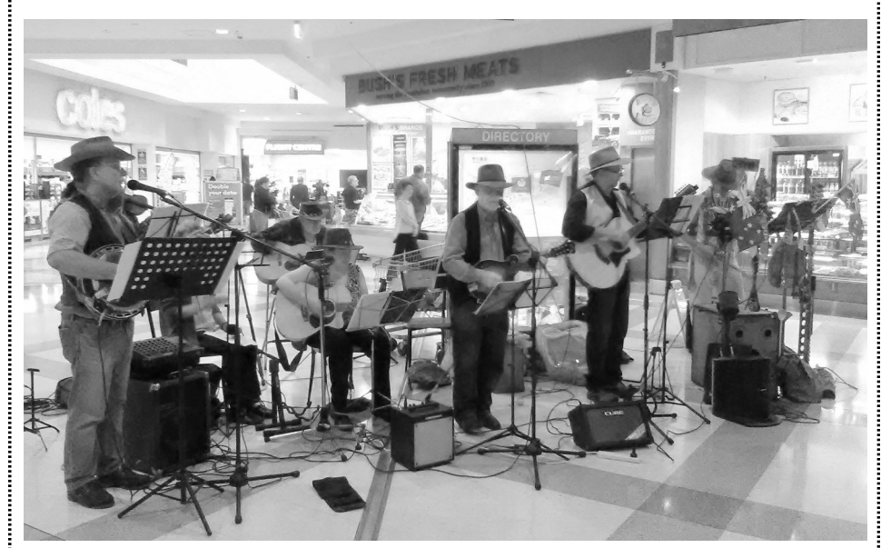
Concert Party performing at Winston Hills