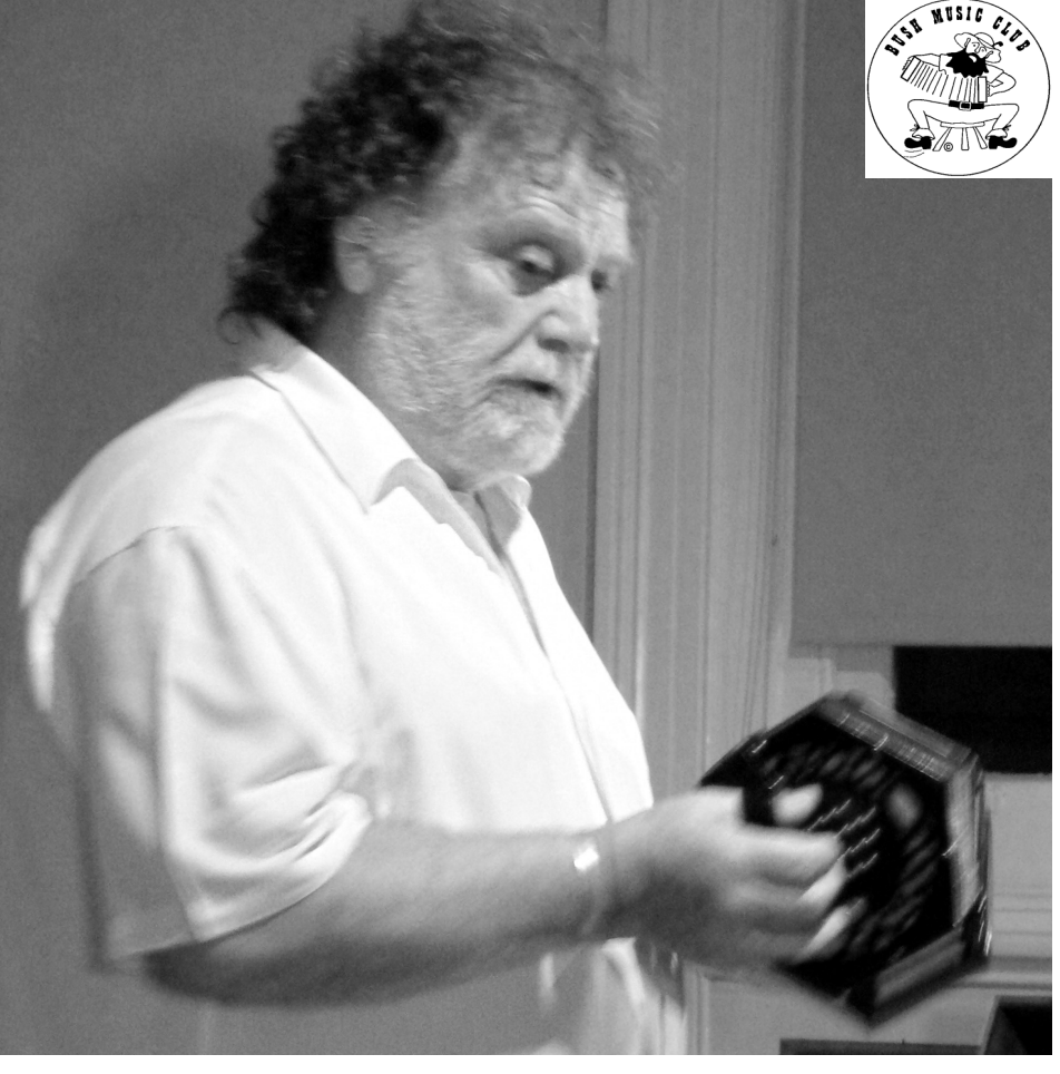
No. 241 Registered by Australia Post