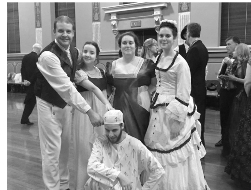
Convict mixing with the gentry