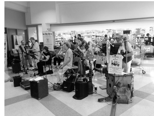
Concert Party at Winston Hills