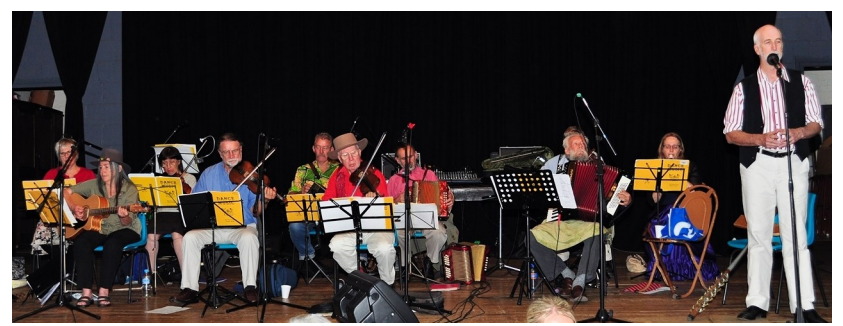
Concert Party at Beecroft (Dec 2013)