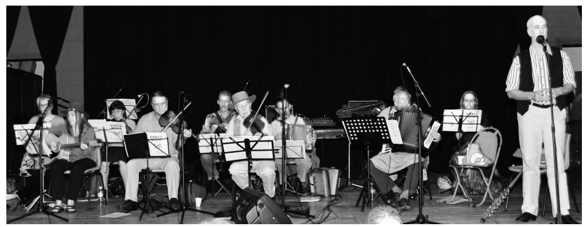
Concert Party at Beecroft (Dec 2013)