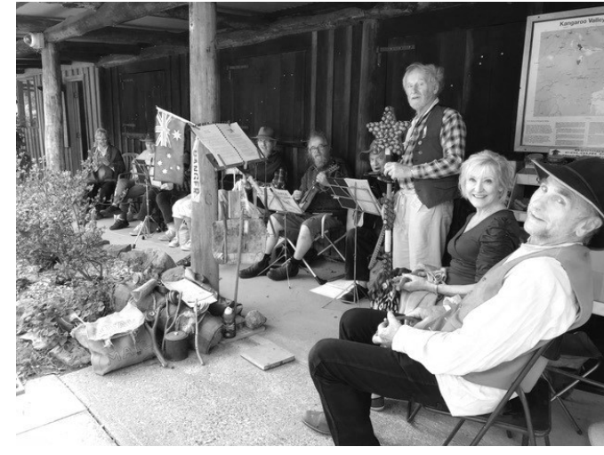
Concert Party at Kangaroo Valley Pioneer Village Museum