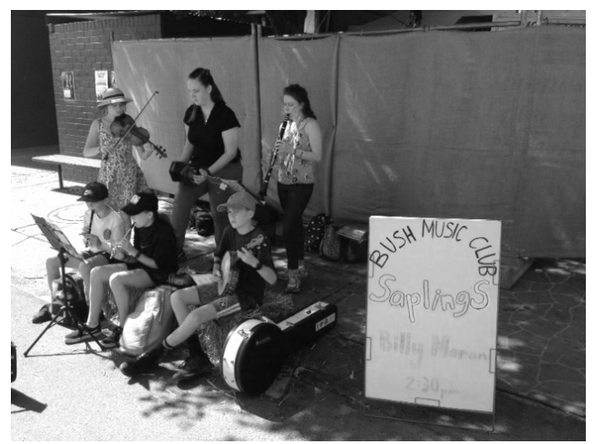
Saplings doing a street performance at the National Folk Festival.

Where: The BMC Hut at Marrickville, Addison Rd. When: Saturday 2pm to 4pm - Jul 14, Aug 11, Sep 8 Cost: $5 or gold coin donation Contact: Karen (02) 9716 9660 OR fongs@bigpond.net.au