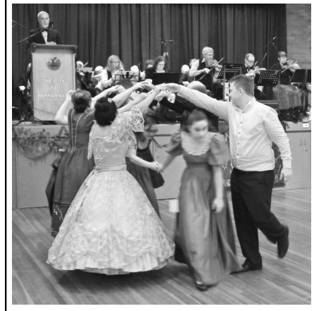
Some pictures from the 2018 Heritage Ball.