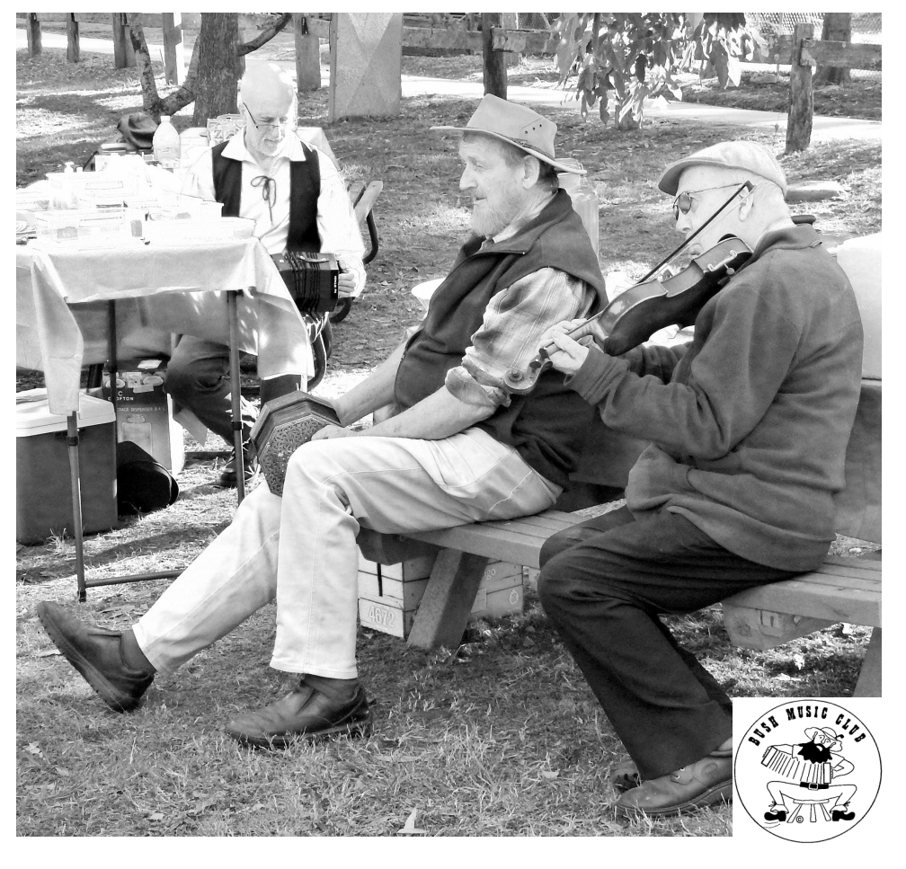
No. 247 Registered by Australia Post