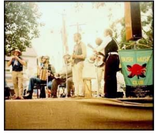
Banner at a Rouseabouts performance.