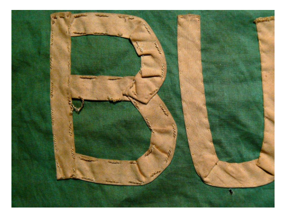
Detail showing the letter still tacked in place (now part of history)