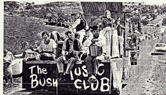
The Woman's Day headline and picture of the 1969 Tuena visit.