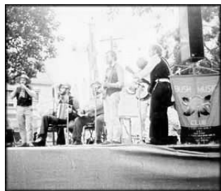
Banner at a Rouseabouts performance.