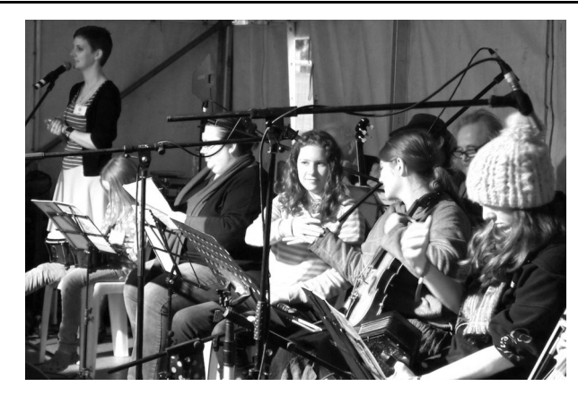
Our Bush Music Club Youth Bush Band will be playing at the 2020 National Folk Festival in Canberra.

To be held at: The Pennant Hills Community Centre & Library, Yarrara Road, Pennant Hills. (Opposite the railway station.) We are in the downstairs hall, enter through the doors in the car park.