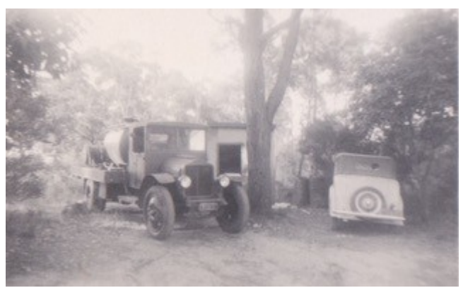
The Heathcote Bush Fire Engine parked up the top of Dillwynnia Grove.

https://blog.bushmusic.org.au/2020/01/poem-from-past-phantom-horse man-of.html