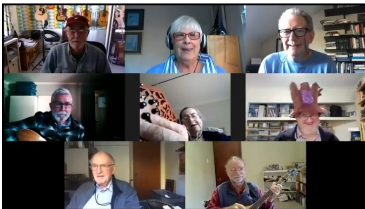
Concert Party Zoom session.