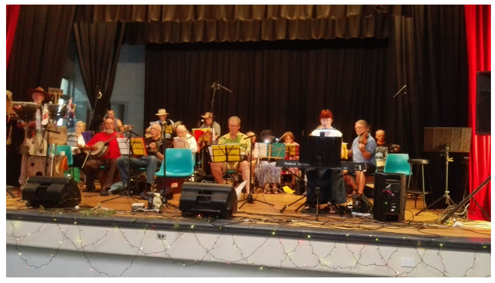
Concert Party will be playing for the Beecroft Dance in June.