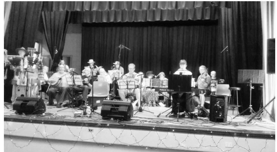
Concert Party will be playing for the Beecroft Dance in June.